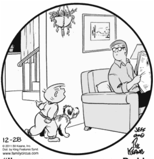
"I'm gonna say my prayers, Daddy. Do you have any requests?"

Our culture has turned away from God and has lost the true meaning of being thankful. An ungrateful heart is a cold heart toward God. The bible tells me that when I struggle in life, count it all joy . (James 1:2-4)